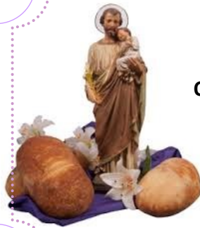
Table Fellowship & Feasts